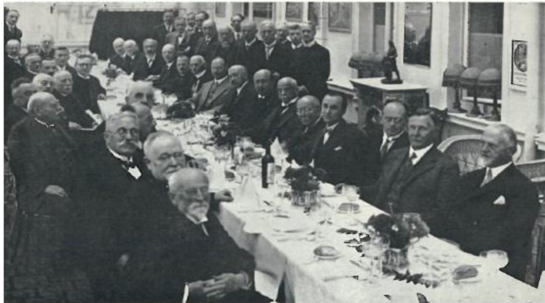
Hauptausschußsitzung am 19. Oktober 1929 in Weimar

Germany's central, self-governing research funding organisation